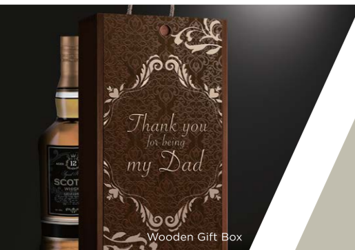
Wooden Gift Box