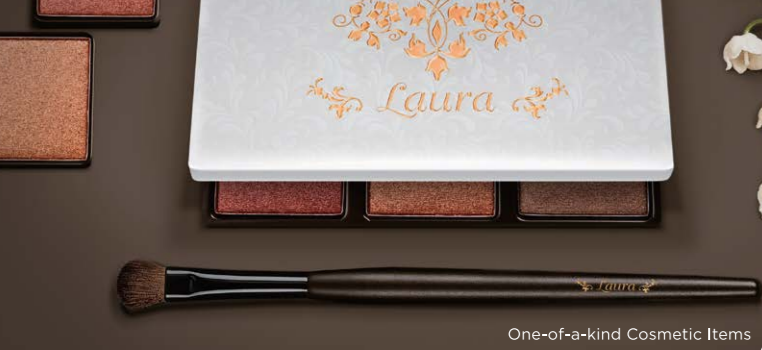
One-of-a-kind Cosmetic Items